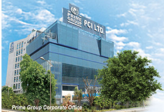
Prime Group Corporate Office